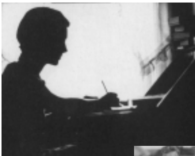
Left: Anne Morrow Lindbergh writing North to the Orient