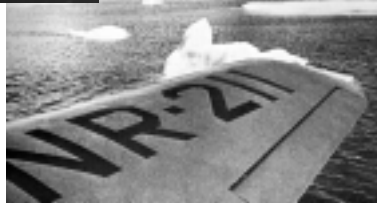
Right: After landing among icebergs at Angmagssalik, east coast of Greenland, August 6, 1933

The conference will take place November 13, 2004, 9AM-5PM in the Student Union Ballroom, Florida Gulf Coast University, 10501 FGCU Blvd. South, Fort Myers, FL 33965-6565