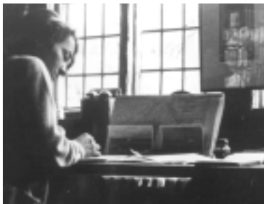
Left: Anne Morrow Lindbergh writing Listen! the Wind