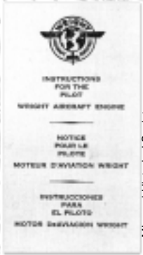
Sirius Instruction Manuals