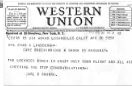
Right: Congratulatory telegram from Lockheed, April 20, 1929