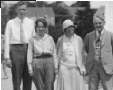
Right: Charles and Anne Morrow Lindbergh with her parents before take off, North Haven, ME, July 30, 1931