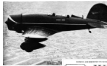
Left: Charles and Anne Morrow Lindbergh test flying the Sirius before transcontinental record.